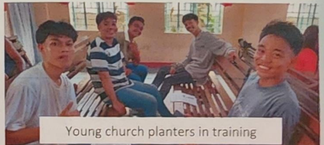
Young church planters in training

Since the Diawas started young, they are eager to train young people to grow into church planters through regular Bible instruction and practical experience. We have been starting churches and training church planters with the Diawas for 30 years.